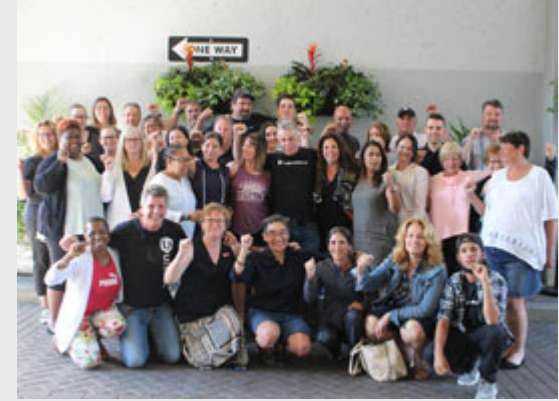
2,720+ Ontario members contacted by live phone surveys, 77,000+ via recorded voice broadcasts & 8,000+ members' doors knocked.