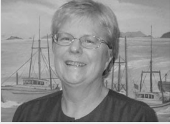
Unifor activist appointed to B.C. Wild Salmon Council to advise on public policy and provide guidance to government.